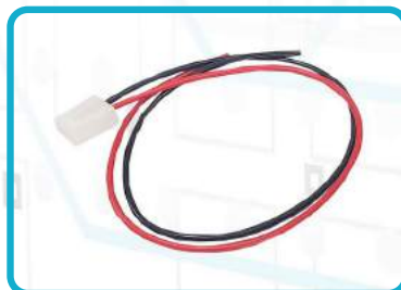
3 Pin female connector for AC input supply