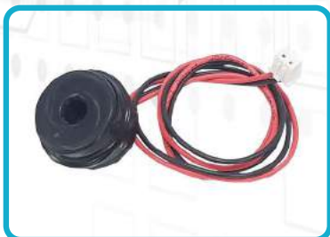
CT coil with pluggable connector